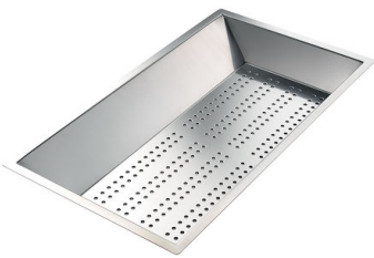
Stainless steel perforated tray

* only in combination with the accessory 8644 101