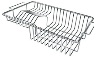
Stainless steel plate rack

* only in combination with the accessory 8644 101