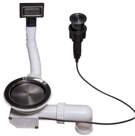
Space Push Gun Metal automatic waste fitting - PO